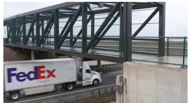
The pictures above represent examples of what the bridge may look like when complete.