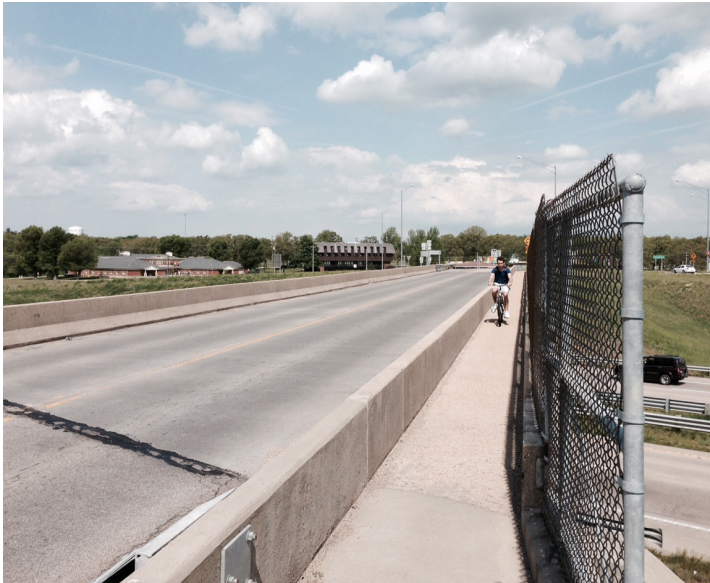
Above is a picture of the current condition of the University Drive bridge over I-44.

The existing bridge over I-44 does not meet current standards for a combined bike and pedestrian bridge.